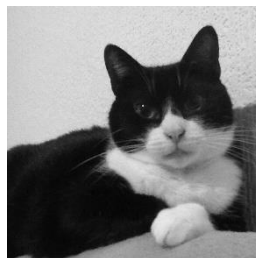
The Ladies of the Manse